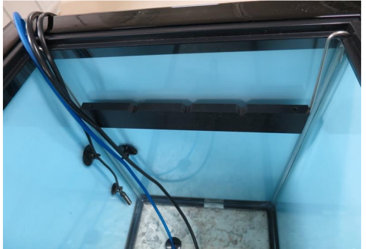
3) Place right side rod hanger through pre-drilled holes