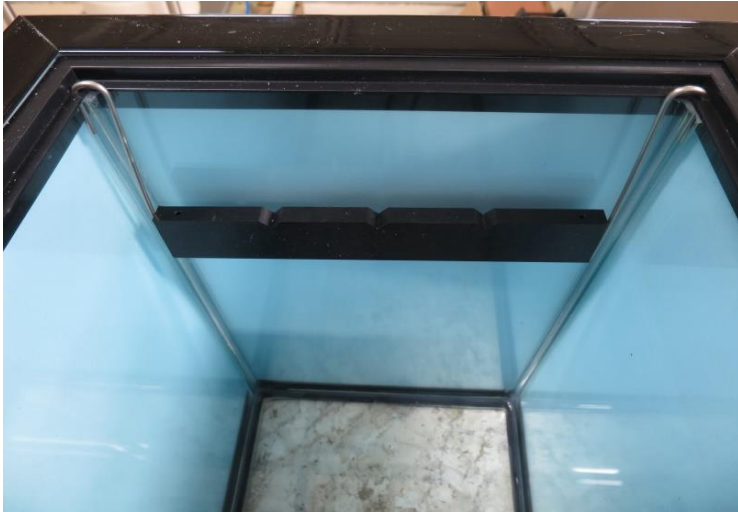
3) Place left side rod hanger through pre-drilled holes