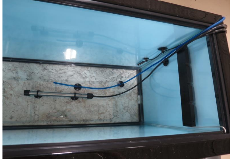
2) Run heater cord, air line, temperature sensor up the back right corner of the tank.