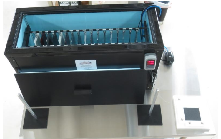
5) View of completed workstation with temperature controller velcroed to the front right corner of the tank